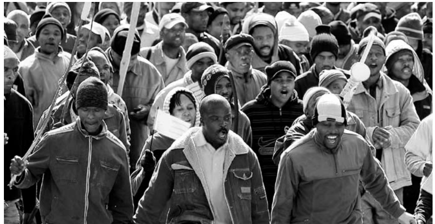
The organised working class – recognised as the primary motive force of the national democratic revolution

The incorporation and prioritisation of the interests and needs of the black working class, which had always been identified as the primary motive force within the liberation movement, in the policies and programmes of the democratic state was therefore regarded as essential. Workers are part of a historic bloc that underpins the state and its developmental orientation. This underpinning is manifested at a political level through the existence of the tri-partite alliance between the ANC, SACP and Cosatu; structured platforms of engagement within the alliance to allow for commentary on organisational policies; and the incorporation of members of all three structures in the representatives to Parliament and the Executive across the three spheres of government.