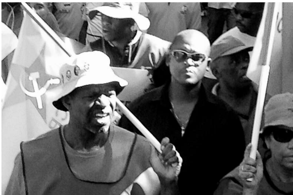
Above: A sea of Red SACP and Cosatu T-shirts floods Pixley KaSeme Street, dotted with masses of gold ANC skippers.